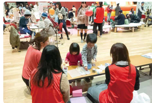
In 2017, three local women who participated in the academy held a mother’s festival in Rikuzentakata City with funding from the Community Action program