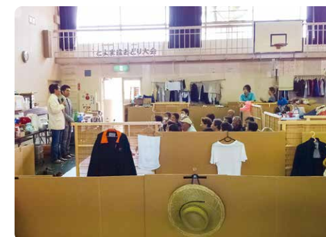
A comforting talk in the Tome City evacuation center