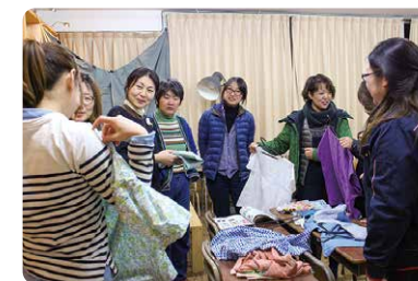
2017 end-of-year mini presentations