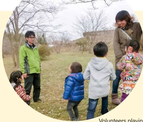
Volunteers playing with children at Tategamori Ark Farm

Takayama in 2015, 11 mothers and 17 children gathered. What allowed those mothers to focus on “turning weaknesses into strengths” was the fact that volunteers were present looking after their children. Most of the young volunteers who attended the meetings were like big brother or sister figures for those children. Every year, at Halloween or Christmas, volunteers would come from Tokyo and transport those children to another world through activities like balloon art. The mothers, children, and volunteers all gathered because the association was important to them, fostering a warm and relaxing atmosphere.