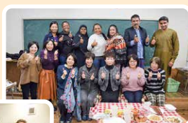
Togura's Women's Association receiving a JICA training