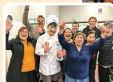
Women pursuing food businesses in Chile and Minamisanriku