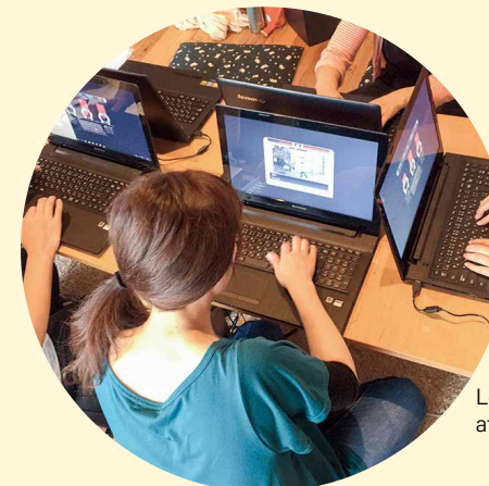
Learning Excel in 2016 at All Together MOS!