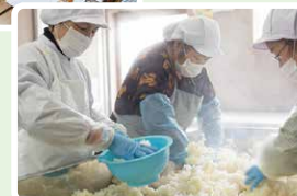
Handmaking miso with local malt