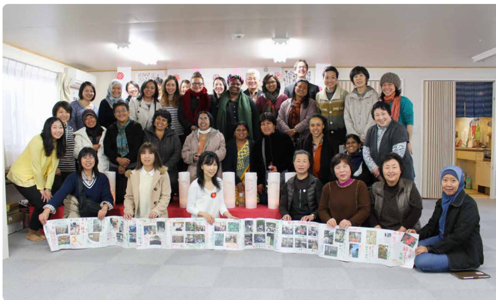
Visiting reconstruction activity group at Tome Miyagi

contributions and leadership in the same way as men are.