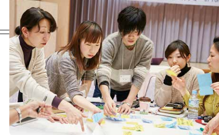
Group work in English and Japanese

We heard the following responses from women from Tohoku's three prefectures that had assembled for the pre-training before the international academy. "It's the first time I've attended a training," and "it's the first time that I've spoken with women active in other prefectures." Many group representatives invited to trainings are male, and it's hard to gain understanding from your family and those around you when a woman wants to leave home to participate in a training, we heard.