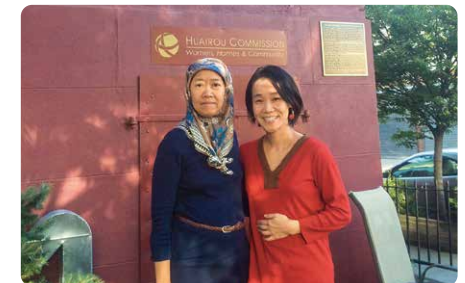
The academy began at the Huairou Commission's New York office

They explained that Huairou's "grassroots academies" run alongside international gatherings like those of the UN or World Bank. The Commission gathers grassroots leaders, has them share