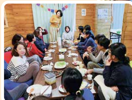
Mexican food party