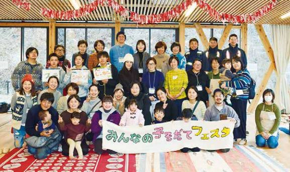
The 2020 Childrearing Festival, held right before the COVID-19 outbreak

and fun, and there was delicious food...Mothers from other areas were really jealous, and wanted to do the same thing themselves.