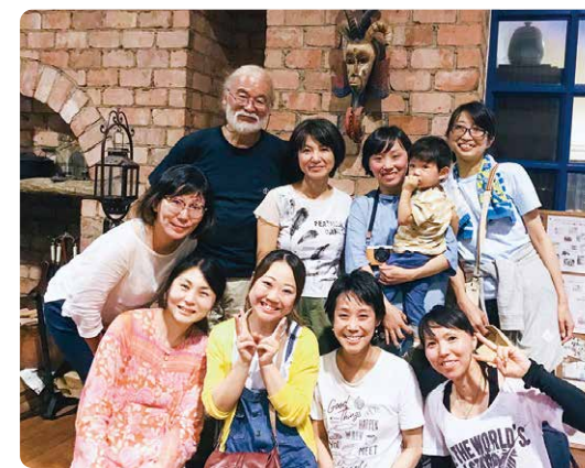
Visiting Atelier Non-electric in Tochigi Prefecture's Nasu Town