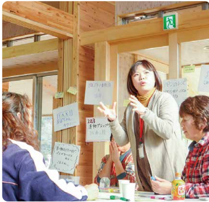
The Minamisanriku Handicraft Marché provided a colorful, fun space