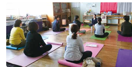
Yoga classes for body and mind

For one of these activities, we planned a "talk salon" inviting women active in the region as guest speakers. Rather than hearing about their projects or successes, we wanted to explore those