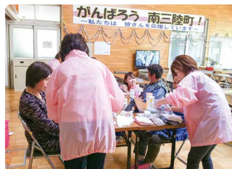
Providing massages while distributing aid in May 2011

This visit stimulated like-minded women from Tome City's Gender Equality