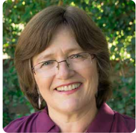
Interview with Dr. Lucy Jones

Founder of the Dr. Lucy Jones Center for Science and Society http://drlucyjones.com/