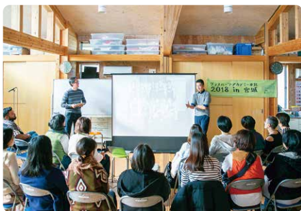
The founder of a non-profit we visited in Los Angeles gives a talk in Japan

We switched the location of trainings between Iwate, Miyagi, and Fukushima each time. To help activate the areas we were visiting as much as possible, we also put time aside to hear talks by people that could act as senpai for the women gathered. The majority of the talks were by people tackling issues