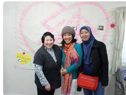
Visiting temporary housing at Tome Miyagi

They become the eyes and ears of the communities through our mapping methodology and transform themselves into an essential body of their community. As they gain knowledge, the authorities have to seek their expertise to determine where to deliver resources or who to support.