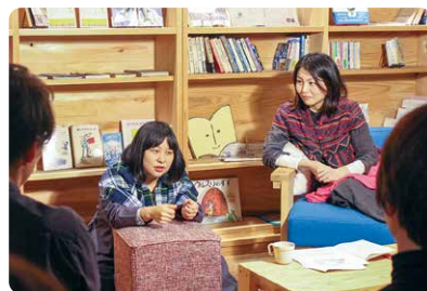
A talk salon. The topic is "her and my future"