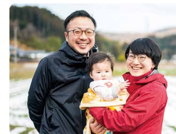
Women active in various fields from COMADO's series, 100 Local Women's Stories.