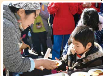
Experiencing traditional local sweets like 'kahō dango' through intergenerational exchange

Efforts to promote intergenerational exchange and co-existence are considered one of the most important measures for building local communities in a society whose population is shrinking (*) . In July 2014, after our visit to Chuetsu with the Minamisanriku Women's Learning Group, we decided to try and put into place our own intergenerational exchange and co-existence efforts, taking as an example the Intergenerational Exchange Center Ninaniina (**) where we attended a talk during the site visit.