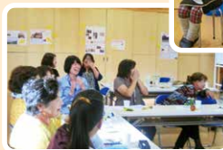
Tea-time with homemade pickles and sweets