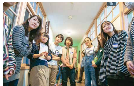
Excitement builds during team-on-team activities

On the surface, the goal here was to have participants introduce themselves and let the others learn about their activities. But it also provided an opportunity for them to practice skills. For instance, to practice explaining what they do and what they value comprehensibly in a short period of time. Each time, we would set up four or five presentation spots, and the participants would station themselves individually at each of them, repeating their presentations four or five times. In three