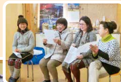
A Minamisanriku Women's Learning Group workshop