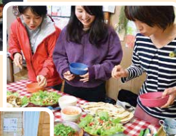
Middle-eastern cuisine event