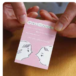
A card from the women's work consultation office as an omamori (good luck charm)