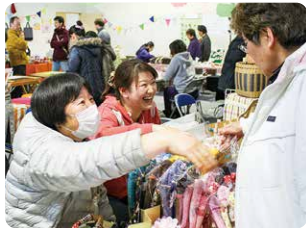
The Minamisanriku Handicraft Marché provided a colorful, fun space