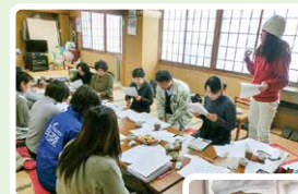
Starting by making minutes of discussions