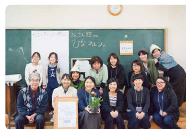
2018 end-of-year Hina Marché