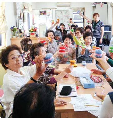
A knitting lesson held with Life Support Project K in Hashikami's community space