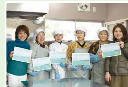
Members sold products and held talks at WE's events too