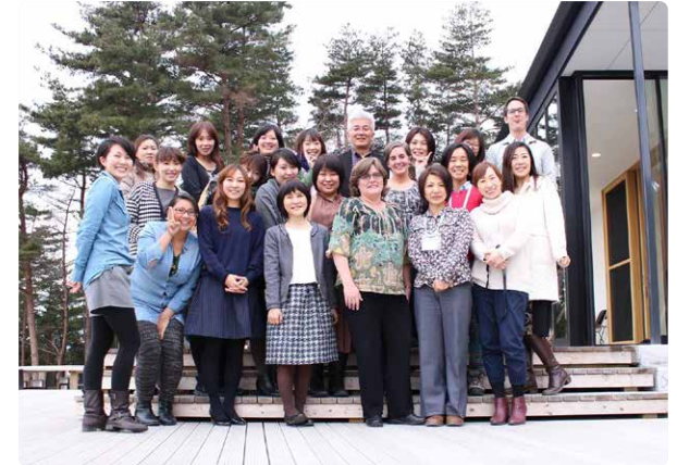
2016 Grassroots Academy in Tohoku, Rikuzentakata, Iwate

One of the things we did when the Women's Eye group came here was a gathering of these Japanese women with California women in Emergency Management. About 50 American women participated, and our host