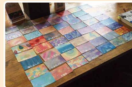
Putting your feelings into words is the first step

The biggest cause of stress is human relationships. Have you ever felt like, "argh, even though I don't want to argue, it's come to this? I really want us to get on"?