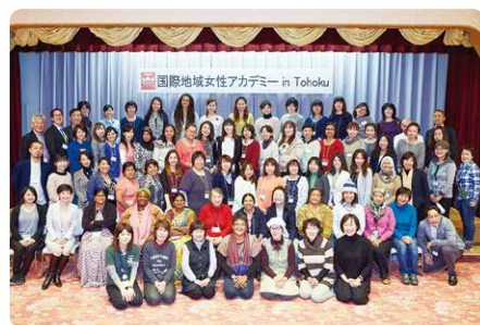
Alongside participants from ten countries and Tohoku's three disaster regions, many local women and others provided food, hospitality, and interpreting

During that process, for instance, we listened as a woman from India spoke forcefully about how before she had experienced a disaster several decades previously, she never left the house, and never spoke in front of people. But to live, and keep her area going, she needed to do something. That's why she