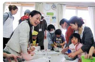
The class on baking bread in a frying pan was popular with parents, children, and seniors