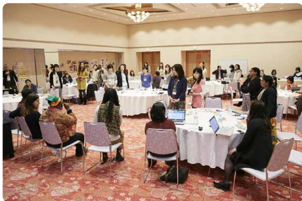
Grassroots Academy held at Minamisanriku Miyagi, 2015, on occasion of WCDRR Sendai

For instance, this year, the Sendai framework for DRR is undergoing a review so we make sure the grassroots women understand what is reviewed and what is not