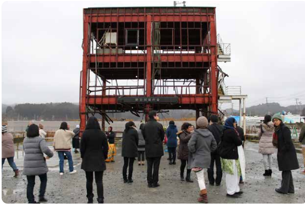
Inspection to tsunami hit area 2015, Minamisanriku, Miyagi