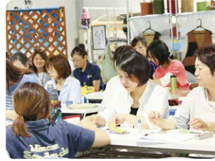
People making crafts loved the color coordination workshop