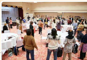
Mingling and learning with women leaders from around the world