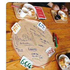
Casual events for breastfeeding women