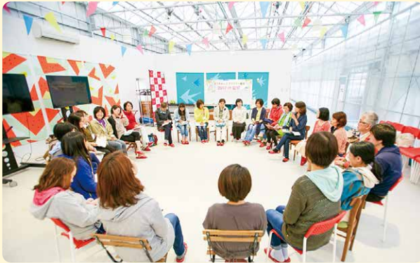
The 2017 Academy in Miyagi, held in Yamamoto Town

Schedule-wise, these weren't events that everyone could take part in. But people arranged for their children to be looked after, etc., and we had lots of participants.