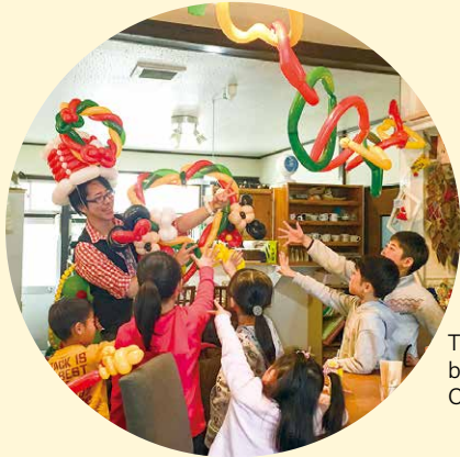
The children's favorite, balloon art, during the Christmas party