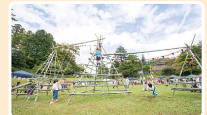
Climbing frames made from local bamboo by carpenters