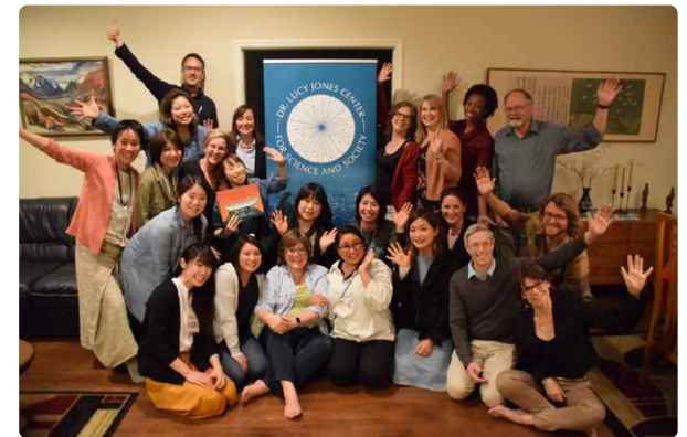
2018 Grassroots Academy in LA, at DR. LUCY JONES CENTER