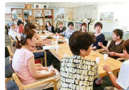
Listening to the stories of powerful women in Chuetsu

By doing this, we started a study group to provide opportunities for learning