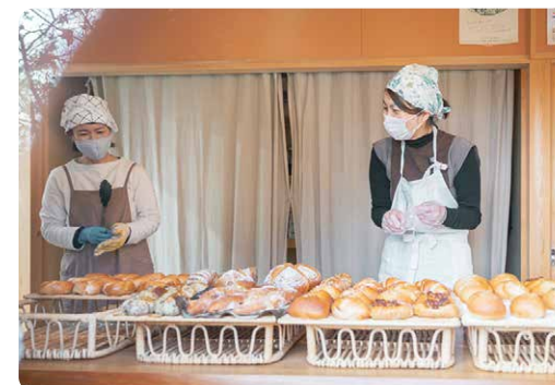
Three times a week, 20 varieties of WE Bread for sale