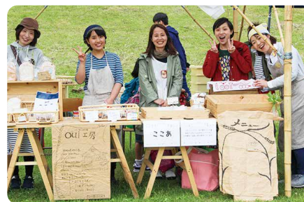
Users selling bread at the Hikoro Marché in June 2017